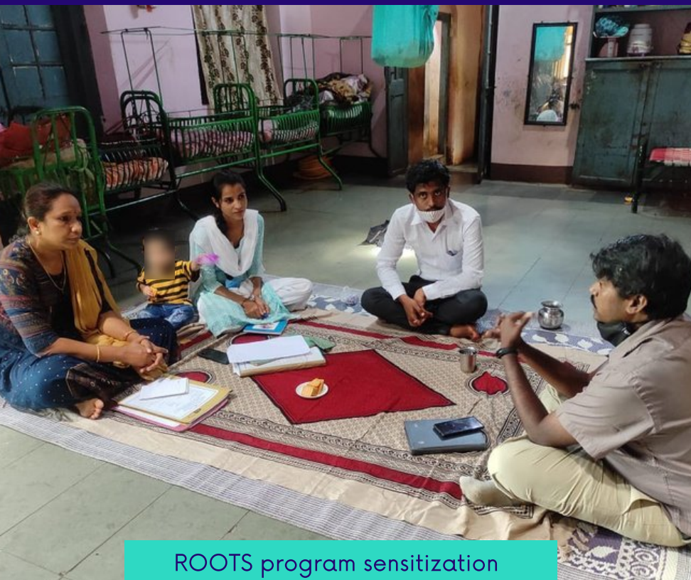
ROOTS program sensitization