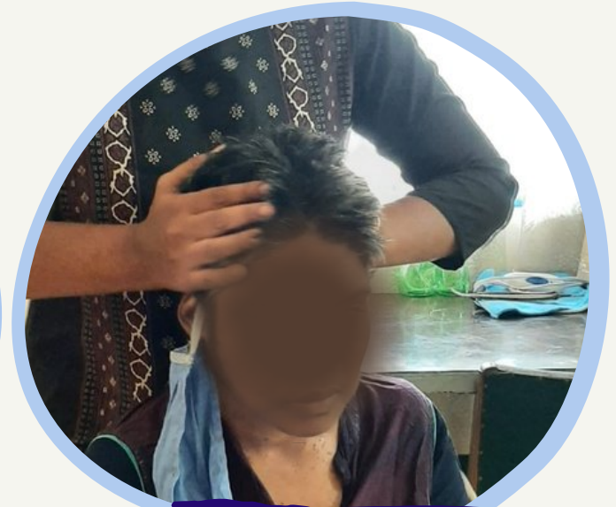
Therapy at Liza's Home