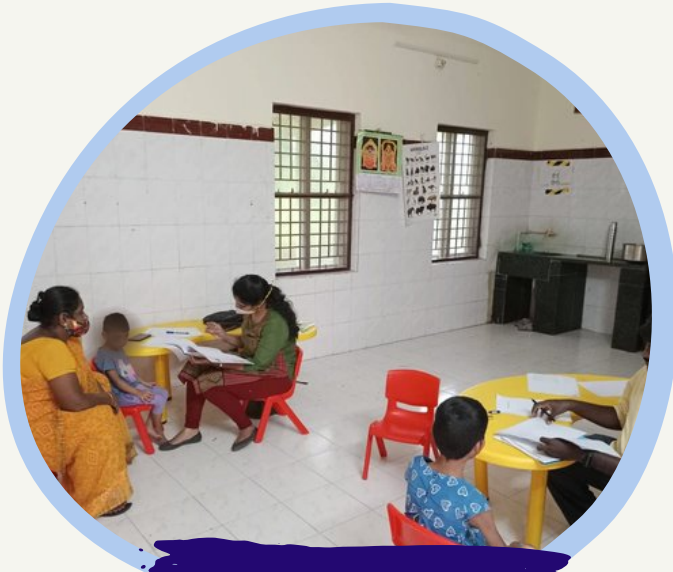
Screening at Shishu Mandir