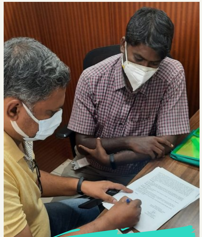
Signing the MOU

We sincerely hope that the program emerges as a model rehab program for children with special needs across all CCLs in India.