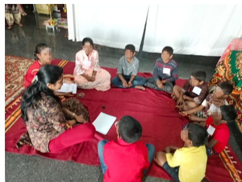
Screening camp at Vani Vidhyashraya