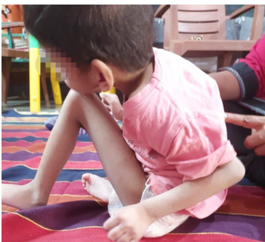
Postural support & training at ASG ↑ Rehab session for ICJH at PACT → center