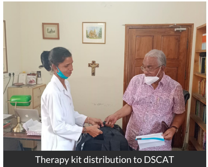
Therapy kit distribution to DSCAT

In a joint venture with The Association of People with Disability, India, PACT visited Dr S.R. Chandrasekhar Institute of Speech and Hearing, Lingarajapuram for campus interviews seeking enthusiastic and social work-oriented candidates for the position of Speech Therapist.