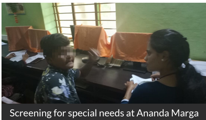
Screening for special needs at Ananda Marga