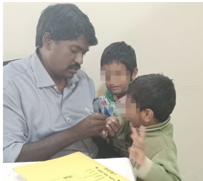
Screening at DSCAT

Salaries will be finalized after the interviews and competency mapping.