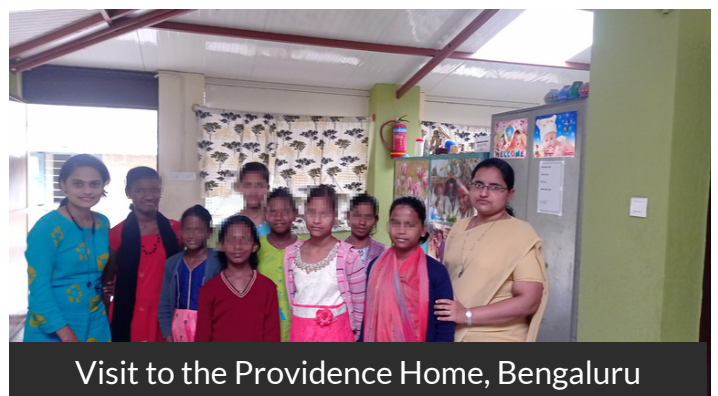
Visit to the Providence Home, Bengaluru