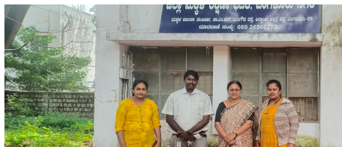
DCPU partnership's official launch