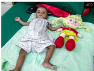
Even as applications for adoptions are increasing year-on-year, most Indians look for 0-2 years old 'healthy child'.

Fewer than 50 children with special needs found a home within India in the past three financial years, accounting for less than 1% of the total 9,443 in-country adoptions between 2019-20 and 2021-22.