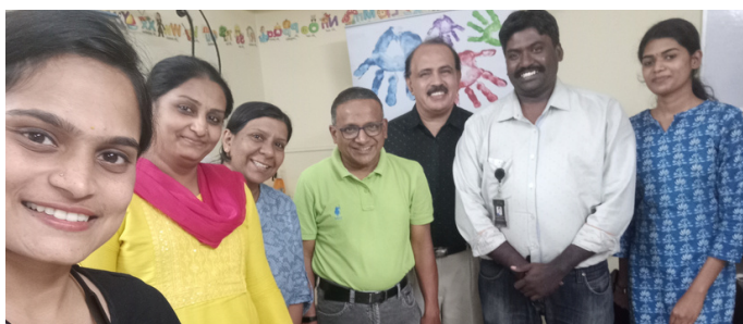
Review of PACT's work

We also provide certificates of appreciation post the successful completion of the internship.