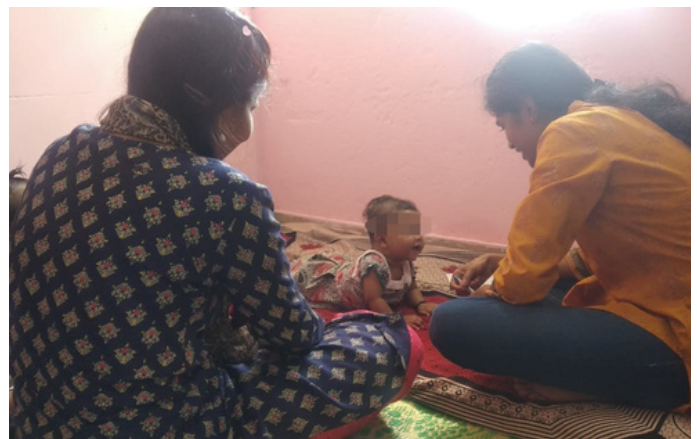
Screening of 3-6 month children. Shishu Griha