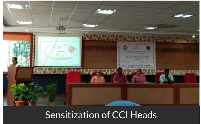
Sensitization of CCI Heads