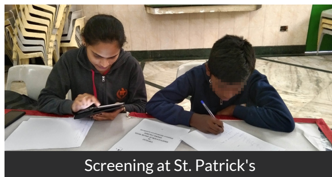
Screening at St. Patrick's