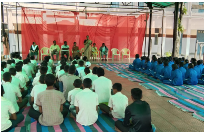
Screening program launch at Govt Boy's Home