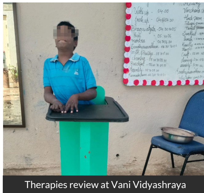
Therapies review at Vani Vidyashraya

Salaries will be finalized after the interviews and competency mapping.