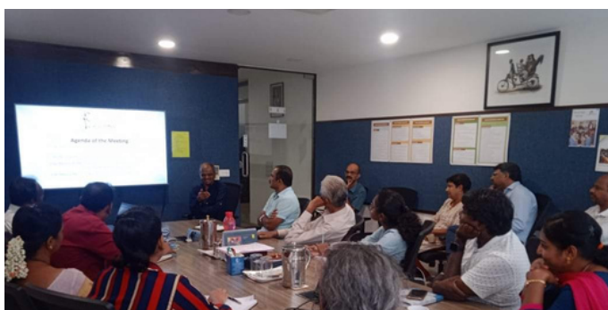
Dhwani Foundation's orientation of its 1-year Niranthara Sahayak Organizational developmental program

We also provide certificates of appreciation post the successful completion of the internship.