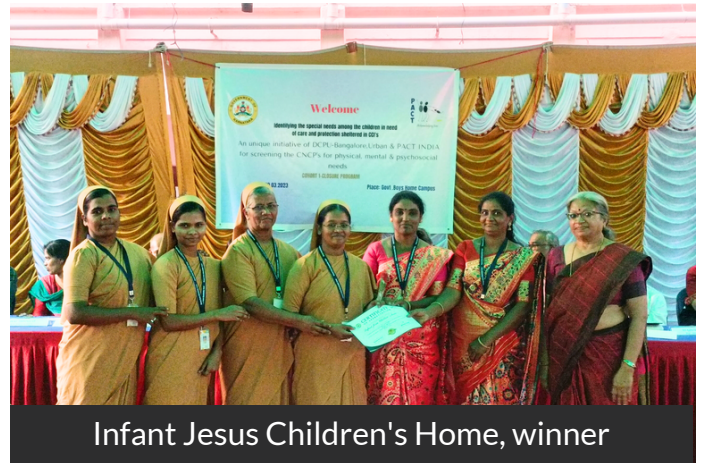
Infant Jesus Children's Home, winner

On the same day, PACT also signed an MOU with the Indian Academy of Pediatrics (IAP) for a program called ROSHAN (Reach out, Share And Nurture), a joint initiative by IAP and PACT to publish training manuals for caregivers in CCIs across Karnataka.