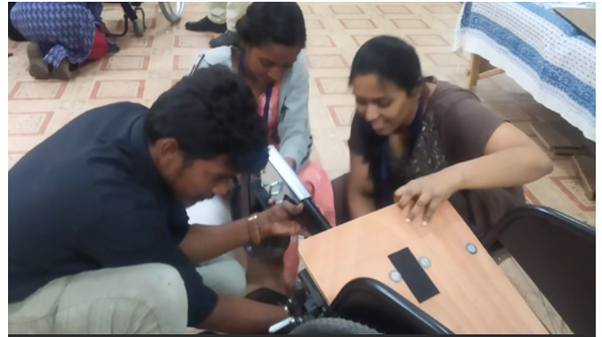
Wheelchair training by Motivation India

UnLtd India and Adhyan Foundation are currently funding PACT India. The funding pitch and budget submission were done for both organisations in parallel.