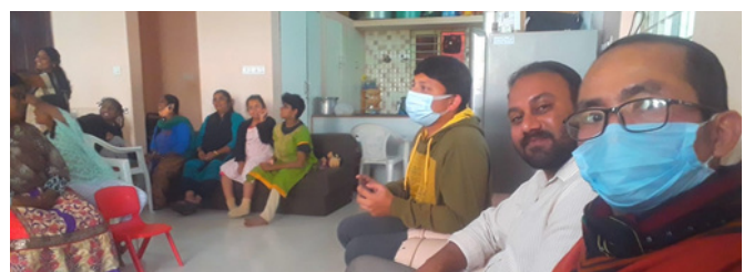
At Grace Foundation Charitable Trust, with volunteers from UTC, Blr

We also provide certificates of appreciation post the successful completion of the internship.