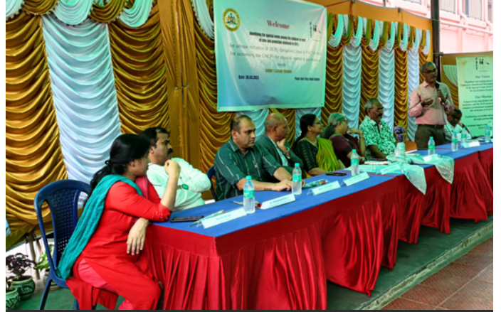
Dignitaries at the COHORT 1 event