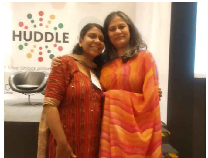
Learning & sharing at UnLtd's Huddle