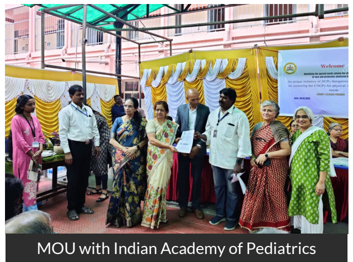
MOU with Indian Academy of Pediatrics