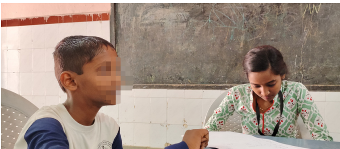
Special Needs Screening for 76 children at the Govt Boys Home, Blr