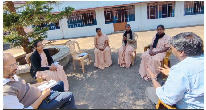
Training & discussion with caregivers