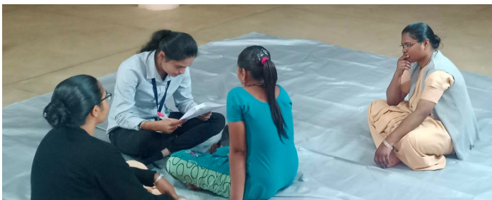
Screening at Shishu Maria Sadan, Odisha