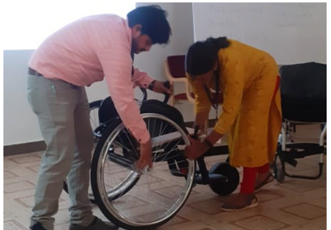
Training of Trainers, WHO -accredited

We believe this training will improve the quality of our services for the betterment of the children and the institutes that shelter them.