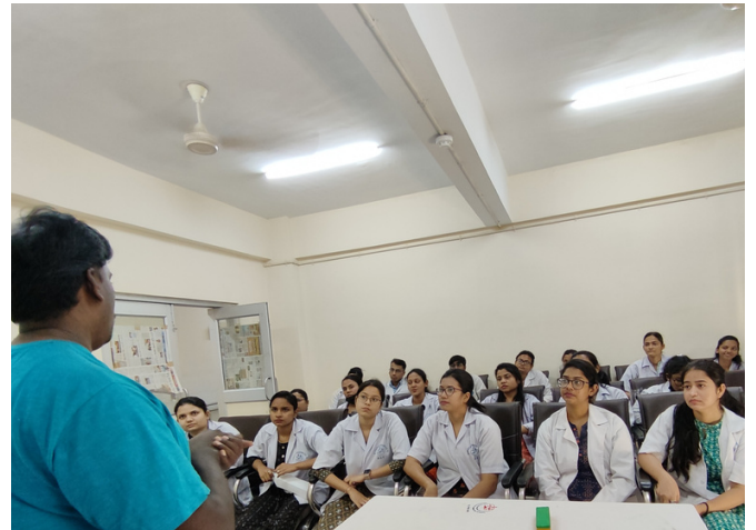
Orientation at Swami Vivekanand National Institute of Rehabilitation Training and Research (SVNIRTAR), Olatpur, Odisha

Salaries will be finalized after the interviews and competency mapping.