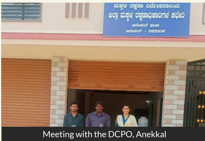
Meeting with the DCPO, Anekkal