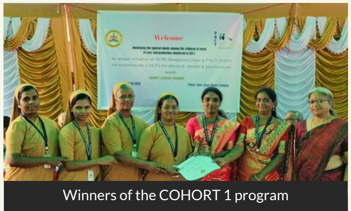
Winners of the COHORT 1 program